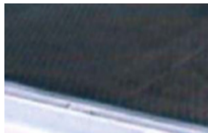
Figure 3. Photo of type 3 bed

The 3 rd bed type has 1 layer like the 2 nd bed type. It has a thickness of 10-12 mm and a weight of 10 kg (Figure 3).