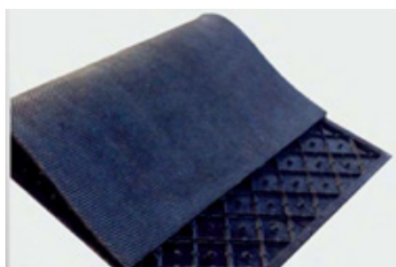
Figure 2. Photo of type 2 bed

The 2 nd bed Type has a structure with a single layer. The bed has a thickness of 2.2 \pm 0.2 cm and a weight of 30-32 kg (Figure 2).