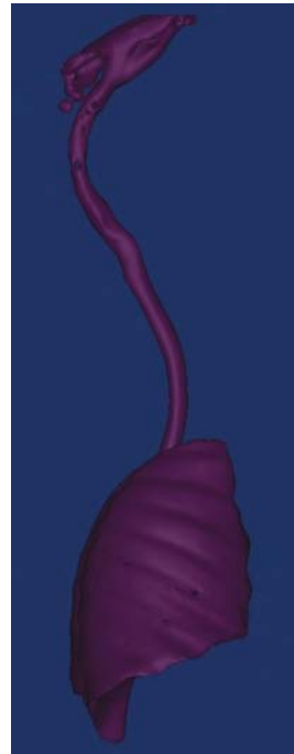
Figure 5. Respiratory system, right-lateral view.