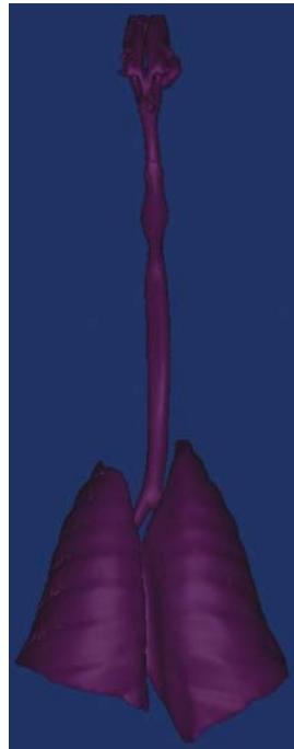
Figure 4. Respiratory system, dorsal view.