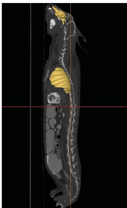
Figure 1. Nasal cavity and lung, left view.

A total of 6 adult New Zealand white rabbits (8-10 months, 2100-2400 g, 3 males, 3 females obtained from Cukurova University, TIPDAM, Adana, Turkey) were used. The study protocol was approved by The Ethics Committee of the Veterinary Faculty. Animals were anaesthetized with combination of xylazine (5 mg/kg, IM, Rompun® inj, Bayer Veteriner Ilac San., Istanbul, Turkey) and ketamine (40 mg/kg, IM, Ketasol® inj, Interhas Veteriner Ilaclari, Ankara, Turkey), then imaged with multislice CT (Somatom Sensation, Siemens Medical Solutions, Forchheim, Germany). Axial images obtained from CT were stored at DICOM formats. 3D reconstructions were achieved by MIMICS® 12.1 (The Materialise Group, Leuven, Belgium) computer software. Volume and surface area of respiratory system were calculated by automatically with computer software.