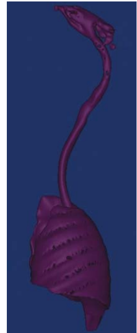
Figure 6. Respiratory system, left-lateral view.

Volumes and surface areas of respiratory system are expressed as mean \pm SEM.