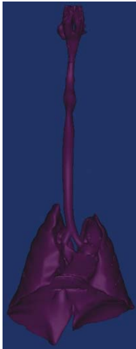
Figure 3. Respiratory system, ventral view.