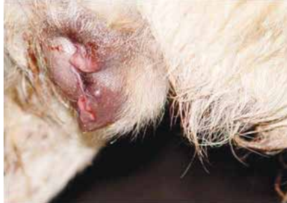
Figure 2. Appearance of vulva in the bitch with TVT.