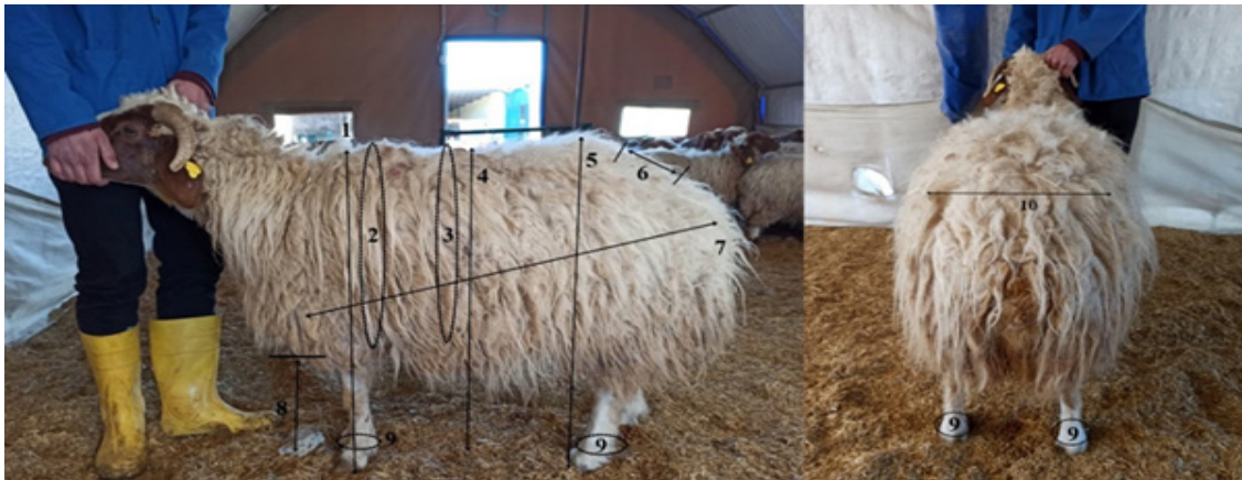
Figure 1. The regions where external structure measurements were taken in Awassi sheep. 1: Withers Height, 2: Chest Circumference, 3: Bicostal Diameter, 4: Ridge Height, 5: Rump Height, 6: Rump Length, 7: Body Length, 8: Sternum Height, 9: Shin Circumference, 10: Pelvis Width

Morphometric measurements taken from radiography images of Awassi sheep (Gündemir 2020, Gürbüz 2018, Pazvant et al 2015, Onar et al 2008, Von den Driesch 1976) (Figure 2):